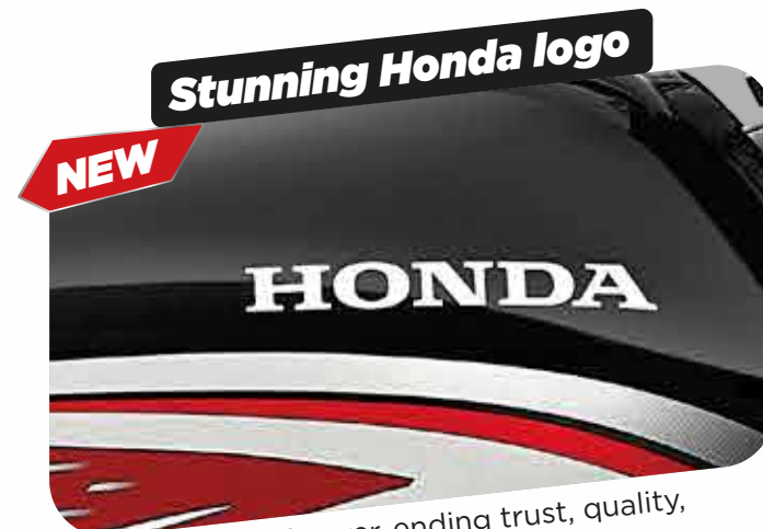
The symbol of never-ending trust, quality, and reliability.